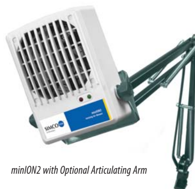
minION2 with Optional Articulating Arm

The minION2 ionizer is designed for portable or permanent operation. The stand provided can be used in a permanent operation by bolting it to a sturdy flat surface such as a wall or shelf. The optional Articulating Arm offers flexibility for directed ionization into hard to reach target areas.